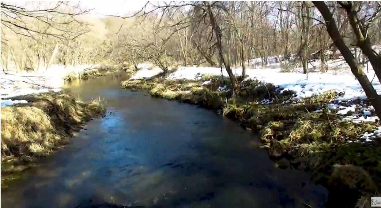
A stretch of Trout Run Creek before restoration work began.

Through a collaborative, multi-agency effort the streambanks were stabilized, invasive vegetation was removed, and in-stream habitat features such as root wads, tree trunks and boulders were installed to support all life stages of trout. The project removed tons of sediment, reduced phosphorus runoff and preserved the long-term health of the stream.