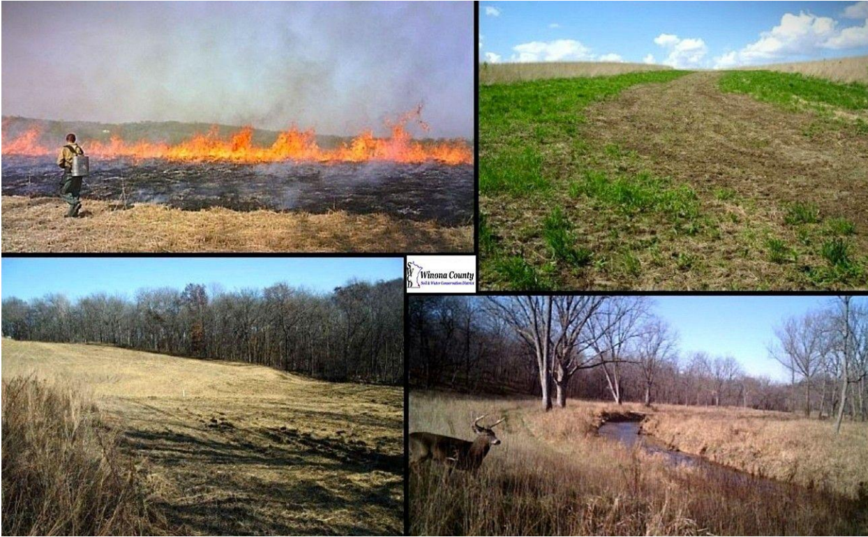
A collage of photos by Claire Bender and Sue Ramthun showing a few snapshots-in-time during their conservation projects. (Submitted photo)

Beginning in 2020, they worked with a professional service to systematically treat invasive species such as buckthorn, garlic mustard, wild parsnip, honeysuckle, bull thistle and black locust across the property.